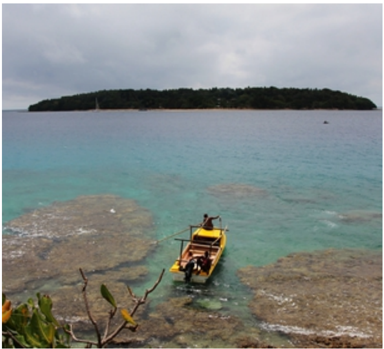
Little Wala island, off Malakula, may have been a partial inspiration to Michener for "Bali Hai"

I flew Air Vanuatu from Port Vila to Norsup Airport in central Malakula. I was surprised to find that the airport terminal had been burned down years ago by a disgruntled loser in a land dispute, and had never been rebuilt, since it would likely be burned down again! Luckily the airstrip still functions.